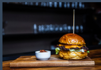
plate to set up your lighting and camera angle. When the second arrives, photograph it quickly before it begins to cool off. Watch out for annoying details, especially in the background.